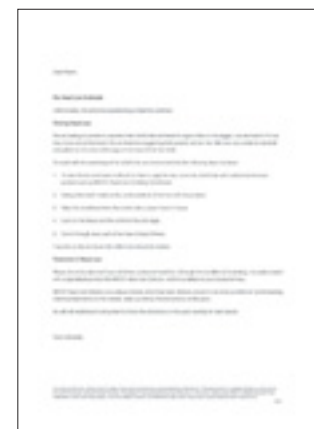
Parents Info Letter