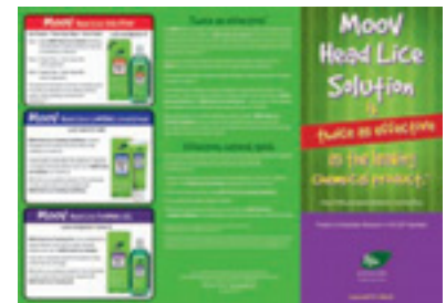
Head Lice Info Brochure DL